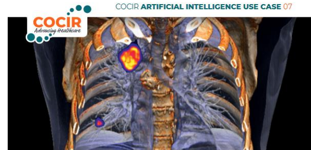
AI IN CHEST IMAGING