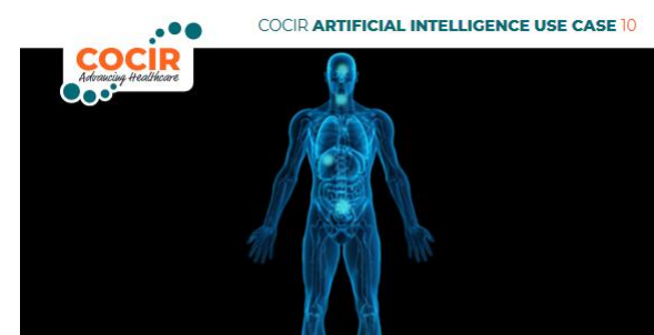
AI BASED RADIOTHERAPY TREATMENT PLANNING SOLUTION