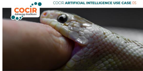
SNAKEBITE & SNAKE IDENTIFICATION VIA MOBILE DEVICES