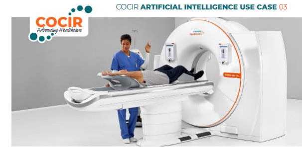
AI IN PATIENT POSITIONING FOR COMPUTED TOMOGRAPHY IMAGING