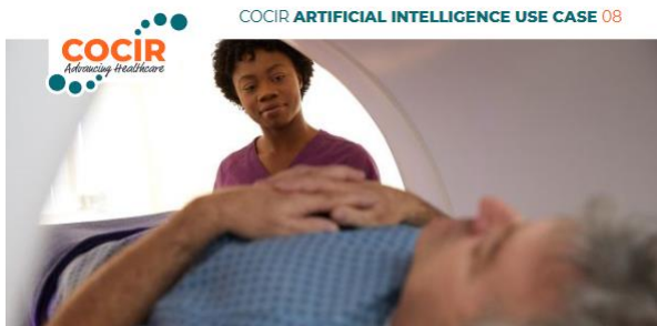
AI IN ADAPTIVE RADIOTHERAPY