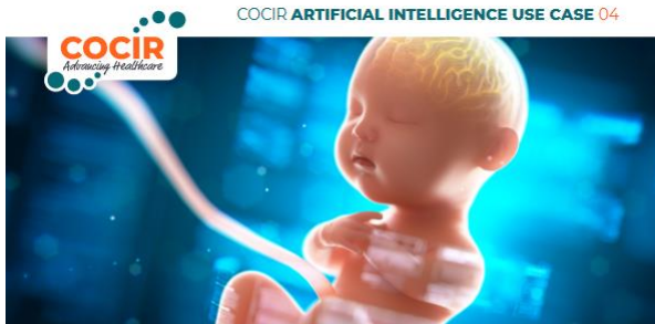
AI WOMEN'S HEALTH ULTRASOUND