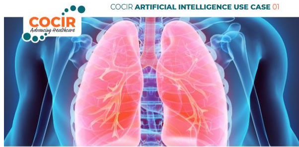
AI IN CHEST IMAGING