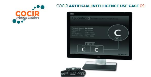
AI IN MAMMOGRAPHIC BREAST DENSITY