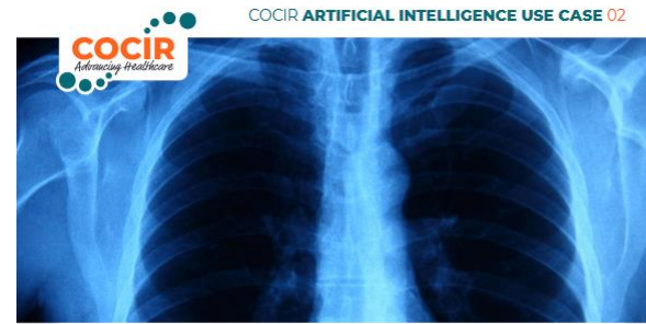
AI FOR PNEUMOTHORAX (PTX) DETECTION & IMPROVED WORKFLOW PRODUCTIVITY